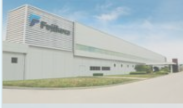
Prachinburi Factory 1