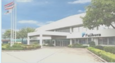
Navanakorn Factory 2