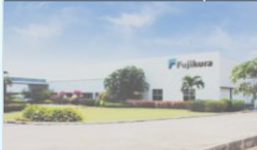
Kabinburi Factory 1